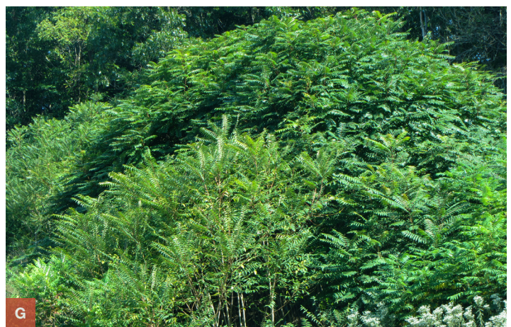
A. Bark B. Compound leaf C. Smooth leaf margin showing glandular teeth D. Brown spongy pith E. Leaf scar on twig F. Winged seeds called samaras G. Clonal patches growing along highway

of these native trees all have teeth, called serrations, while those of tree-of-heaven are smooth. The foul odor produced by the crushed foliage and broken twigs is also unique to tree-of-heaven.